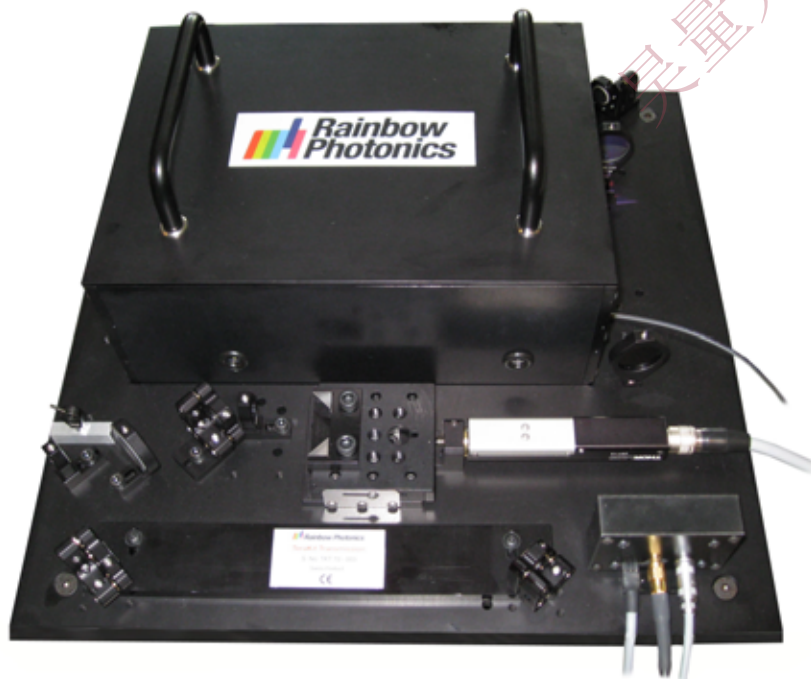
TeraKit® optical board (38 cm x 38 cm)

The TeraKit® provides a flexible solution for laboratory THz spectroscopy. It is based on organic crystals, to allow access to terahertz frequencies not available with conventional antennas. The TeraKit® includes all optical, mechanical and electronic components for the generation and detection of THz waves such as delay line, terahertz generator, terahertz detector, optics, electronics, dedicated software and laptop. It can be used with any femtosecond laser source at telecom wavelengths.