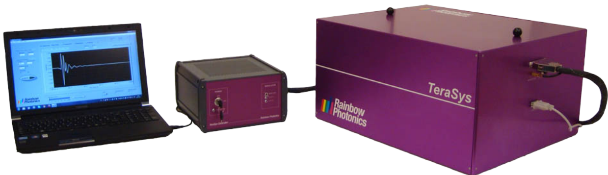
TeraSys ® - AiO (55 cm x 45 cm x 28 cm)

The TeraSys ® - AiO provides a flexible solution for laboratory THz spectroscopy and imaging. It offers maximum flexibility with measurement capabilities in transmission and reflection without realignment of the optics. It is based on organic crystals, to allow access to terahertz frequencies not available with conventional antennas. The TeraSys ® - AiO includes all optical, mechanical and electronic components for the generation and detection of THz waves such as delay line, terahertz generator, terahertz detector, pump source optics, electronics, humidity sensor, purge chamber, dedicated software, and laptop.