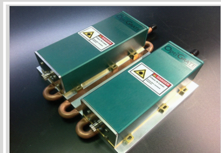
Photograph of a dual-head SEOP laser at 795 nm. Each head is rated for 35 W with linewidth < 40 pm