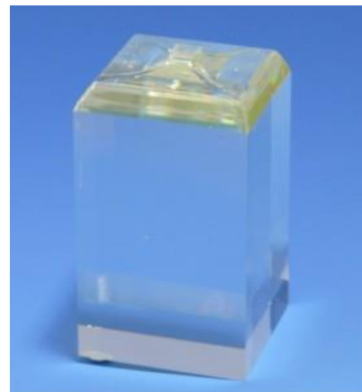
KTN Single Crystal