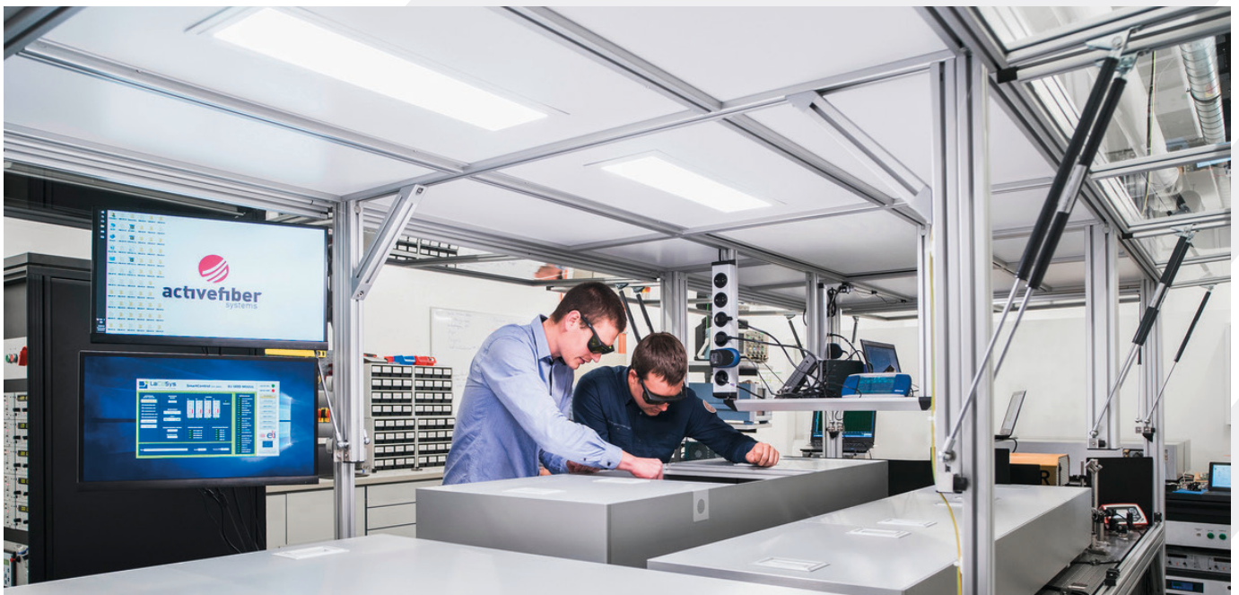
AFS high-power few-cycle laser system