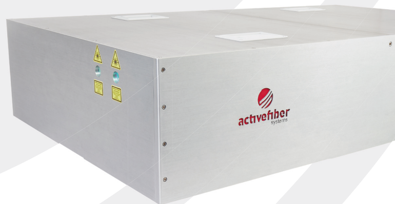
kW-class high-repetition-rate fiber laser