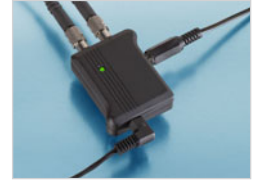
Optoacoustics EOU 100 electro-optic unit showing fiber optic, audio, and power supply connections

Optoacoustics' OPTIMIC 1160 system is comprised of our advanced OPTIMIC fiber optic microphone, electro-optic unit, audio cable with BNC connector, DC power supply and a ruggedized carrying case.