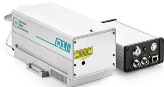
Laser head Q1 with controller unit