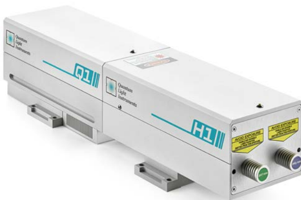
Laser head Q1 with attached harmonic generator module H1

14) Laser can be powered from appropriate 12 VDC power source. Please inquire for details.