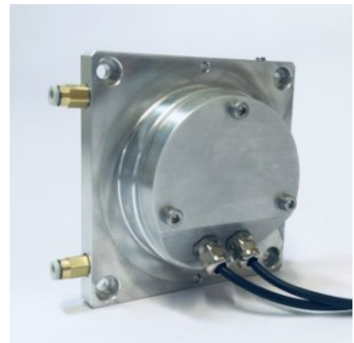
Rear surface of the Zwobbel ® -532 with control and high voltage interfaces.