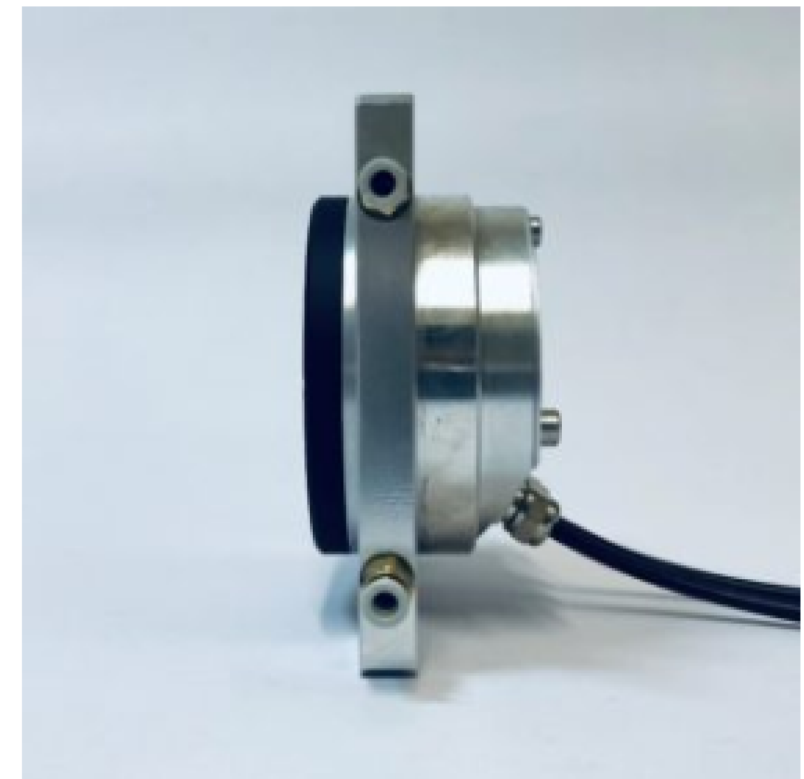
Side view of the Zwobbel ® -532 with its low thickness of 50 mm.