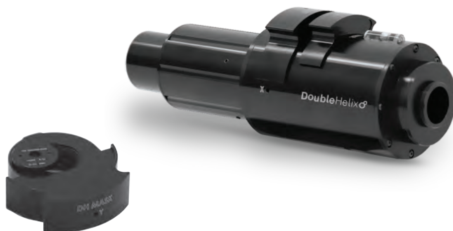
Replaceable mask to fit with your wavelength needs