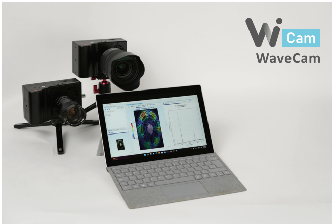
Highspeed cameras Chronos 1.4 and 2.1 with WaveCam software by gfat tech

Optical flow based time and frequency ODS