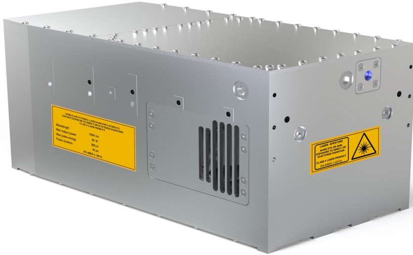
Figure 1: Lampo laser head including driving electronics and air cooling fans.

Bright Solutions is glad to introduce Lampo , the new family of compact ultrafast lasers generating high peak power ps laser pulses at a repetition rate selectable over a wide frequency range, externally triggerable from 50 kHz to 40 MHz.