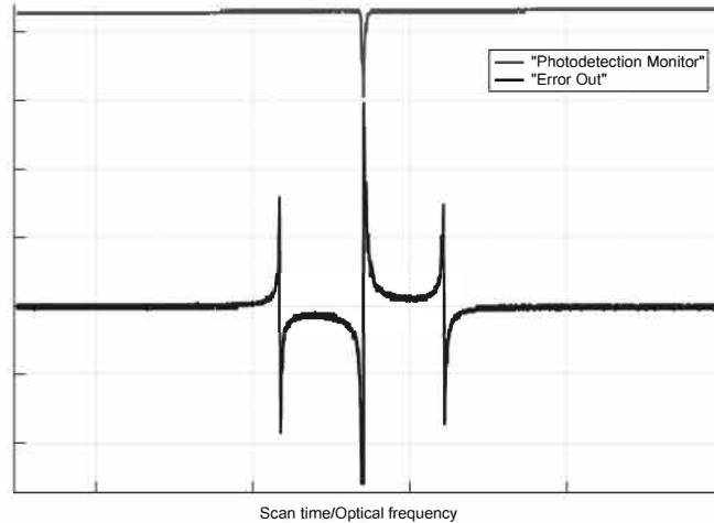
Figure 2: Example PDH Error Signal

These trim pots are adjustable with a flat head screwdriver. Use these to adjust the phase of the RF (amplified photodiode signal) and Local Oscillator for optimum error signal slope, generally obtained by maximizing the height of the main peak and the symmetry of the sidebands. Each adjustment has a range of 0 to 90 degrees. An example may be seen in Figure 2.