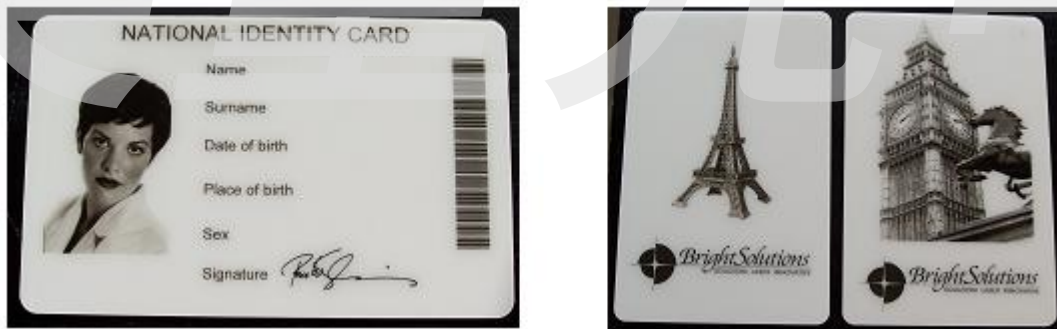
Grey Scale Images obtained using Pulse Energy Modulation