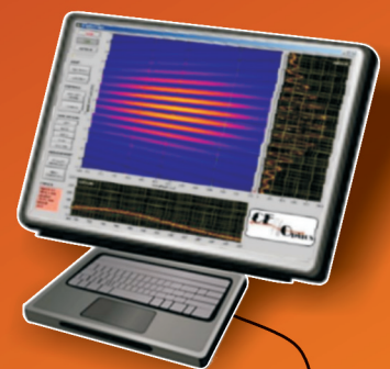
CEO-2D-NIR-V Imaging spectrograph