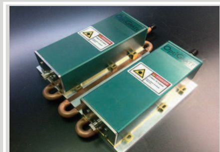
Photograph of a dual-head SEOP laser at 795 nm. Each head is rated for 35 W with linewidth < 40 pm