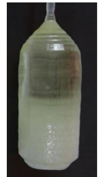
GPS Gadolinium pyro silicate (Ce:Gd 2 Si 2 O 7 )