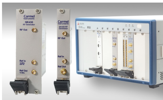
NK420 and NK430 With PXES-2590 Chassis