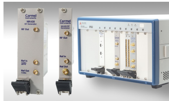
NK420 and NK430 With PXES-2590 Chassis