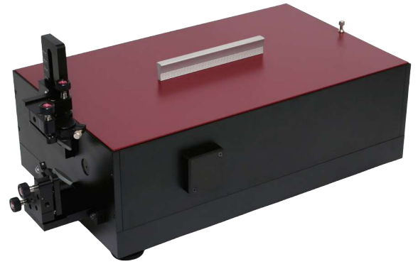
IRA-VISIR Scanning Autocorrelator