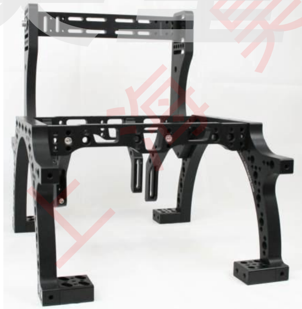
RAMM-FULL , with top-side riser.

These stages are designed for travel centered about an optical axis in the center of the RAMM assembly.