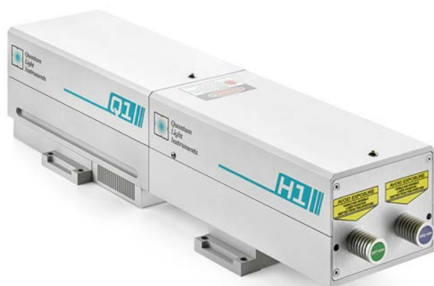
Laser head Q1 with attached harmonic generator module H1

14) Laser can be powered from appropriate 12 VDC power source. Please inquire for details.