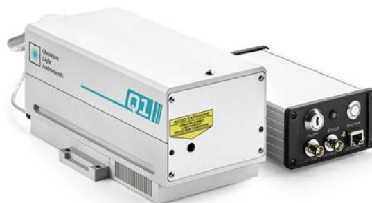
Laser head Q1 with controller unit