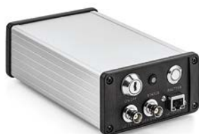
Laser controller unit