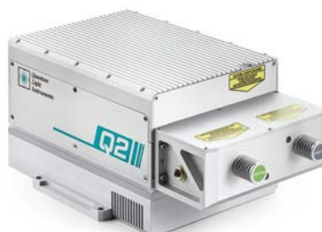
Q2 laser head with SHG module dimensions (in mm)