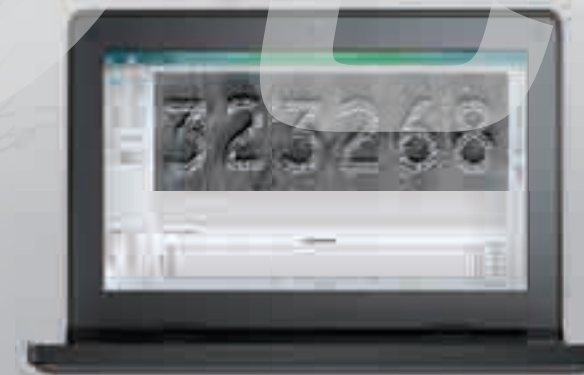
Picture: reconstruction of serial numbers