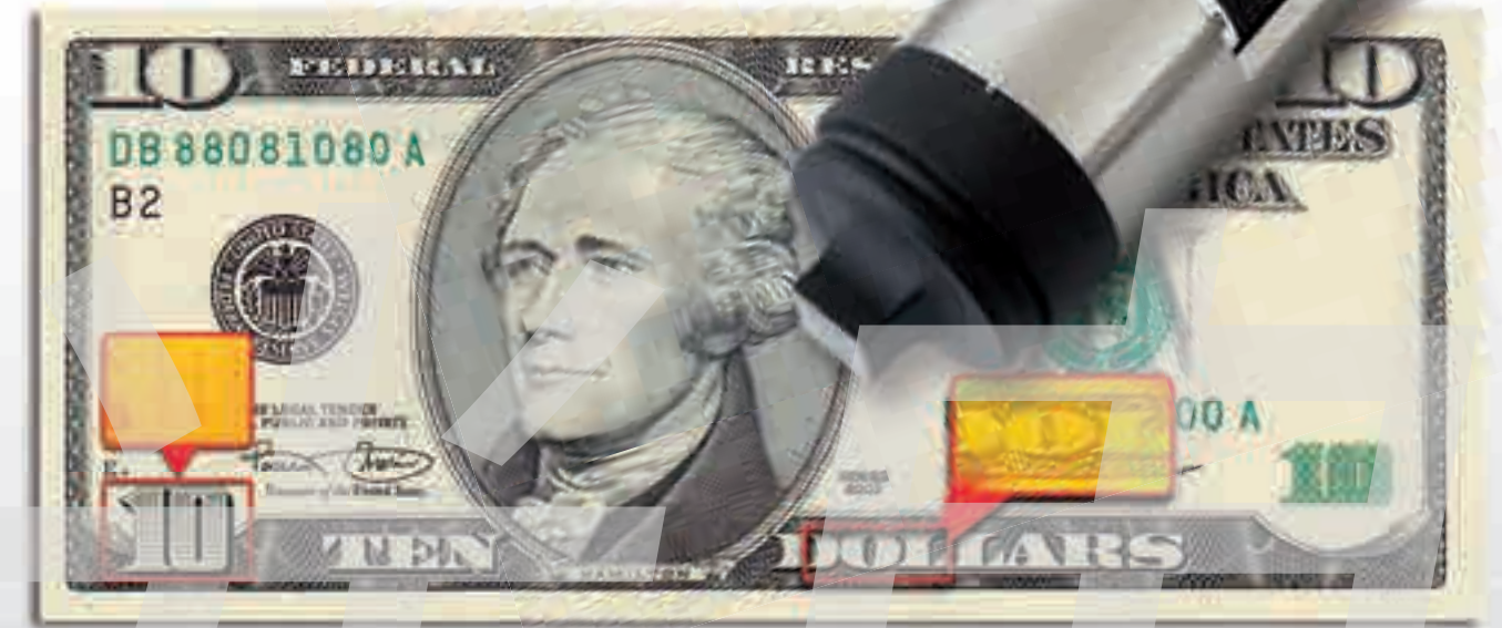
Picture: control of magnetic security features on banknotes

The mageye is able to visualize magnetic stray fields and flux densities in a high optical resolution. The core of the system is an application adapted magneto-optical sensor in combination with a high-resolution USB-camera. The included user software allows a decent post processing of the captured images. Our mobile device especially applies for small and narrow examination environments.