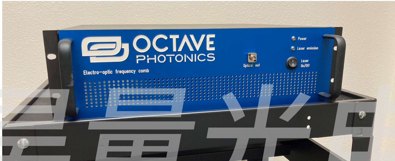
Figure 1. 19-inch rack-mount Base EO comb.

Summary: Electro-optic laser frequency combs (EO Combs) from Octave Photonics provide a reliable method for generating femtosecond frequency combs at repetition rates between 5 and 30 GHz. Octave Photonics specializes in building EO combs with ultra-low phase noise, octave-spanning bandwidth, and femtosecond pulse durations. Applications include spectrograph calibration and dual-comb spectroscopy.