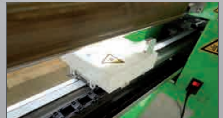
Picture: m-cat measuring slide