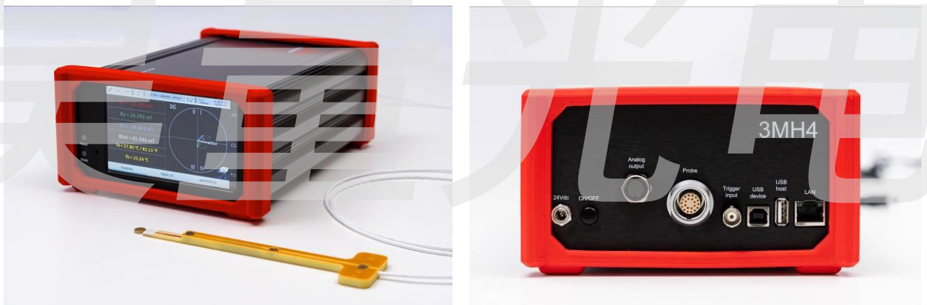
Figure 1: 3-channel digital teslameter 3MH4: front panel (left); rear panel (right)

This teslameter is invaluable for mapping magnetic fields, characterizing systems, current sensing, and quality control in laboratories, production lines, and magnet systems. It's the ultimate tool for precision in magnetic field measurement, offering the future of magnetic field analysis.