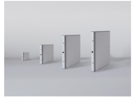
BN-R-SQ - square in different Sizes

Alternatively, the reflection standards are also offered without calibration for use as working standards. In this case, the user performs the calibration on his own using a calibrated reflection standard.