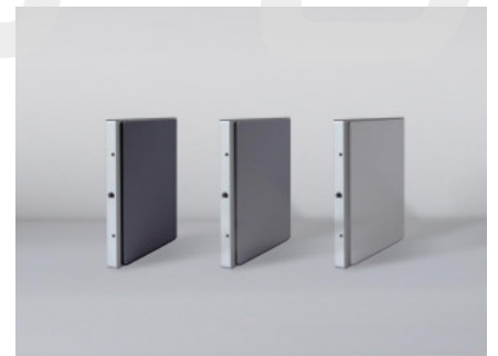
BN-R-SQ - different spectral reflectance