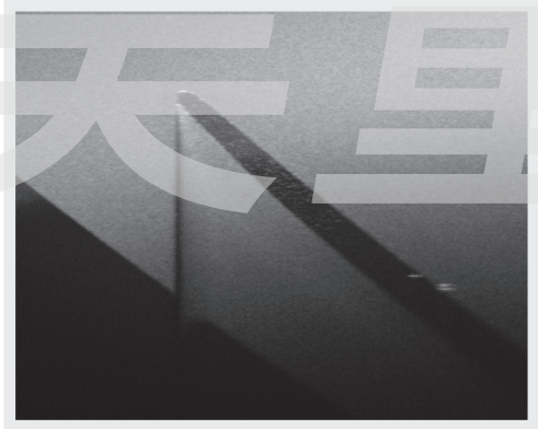
The high resolution of the Cobra 800 enables high clarity nondestructive imaging of sharp features like a contact lens edge.

At Wasatch Photonics, we go beyond custom to create unique, bespoke spectrometers for our OEMs. We'll share our deep understanding of spectrometer and OCT system design, working with you as a collaborator to create products to differentiate you in your marketplace. From custom cameras, gratings, and athermal lens sets to drop-in replacements for legacy designs, we can develop a solution optimized for your imaging needs.