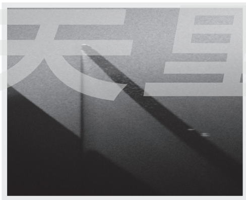
The high resolution of the Cobra 800 enables high clarity nondestructive imaging of sharp features like a contact lens edge.