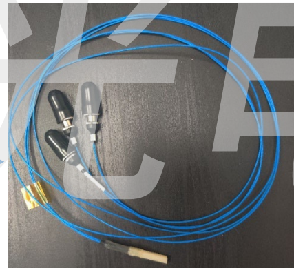
Micro-ring resonator sensor element