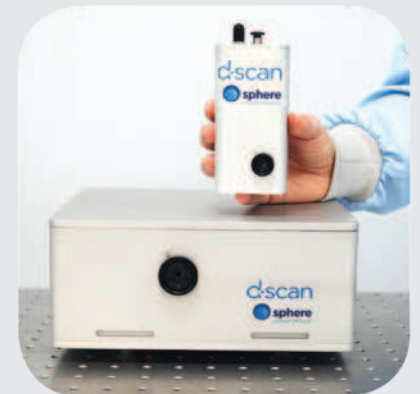
Talk to us for different wavelength range, chirp range, input aperture, and other